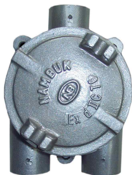
< EOS >