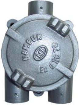
< EOS >